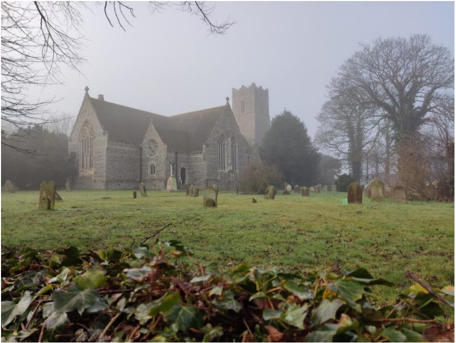
St Margaret's on a misty morning